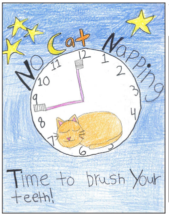
Drea Janaro , J M Hill Elementary, East Stroudsburg Area SD