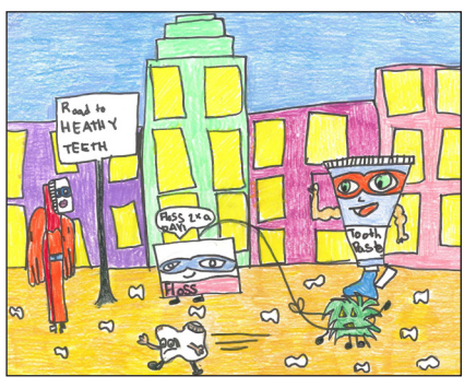
Shreyasi Pabbathi , Gulph Elementary, Upper Merion SD