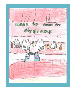
DANIEL SOSA East Stroudsburg Elementary, East Stroudsburg