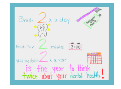
MADALYN COLVIN Lackawanna Trail Elementary Center in Factoryville