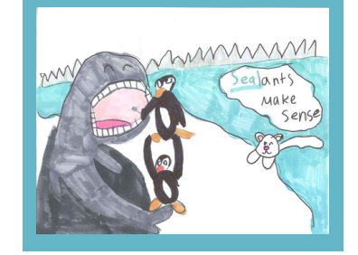
PIPER FARRELL Soloman Plains Elementary in Plains